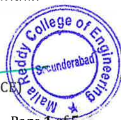
Malla Reddy College of Engineering (MRCE)