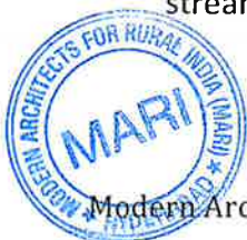
Modern Architects for Rural India - MARI

a. To ensure comprehensive source segregation of waste into the mandatory three streams – wet waste, dry waste, and domestic hazardous waste – at the source within