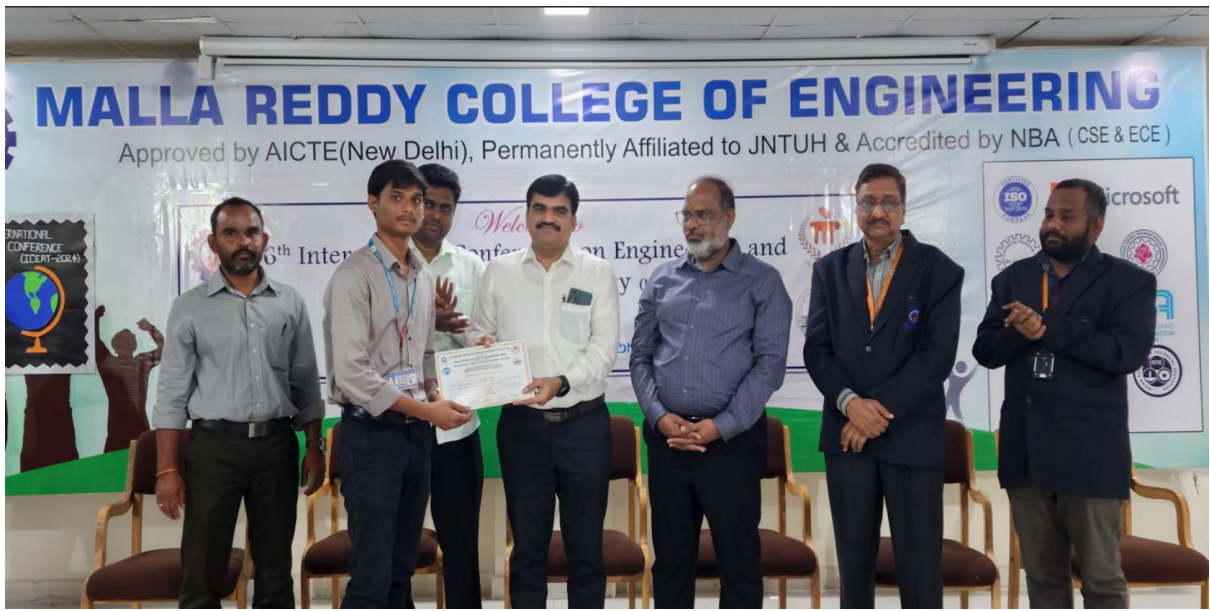
As a token of appreciation, the resource person was felicitated for their valuable contribution and insightful sessions.