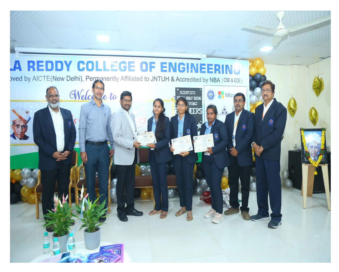
THIRD PRICE RECEIVING IN CELEBRATION OF ENGINEER'S DAY WITH CHIEF GUESTS AND PRINCIPAL SIR