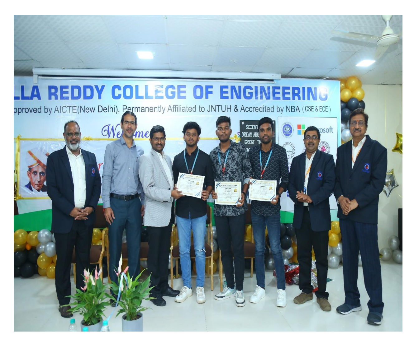
SECOND PRICE RECEIVING IN CELEBRATION OF ENGINEER'S DAY WITH CHIEF GUESTS AND PRINCIPAL SIR