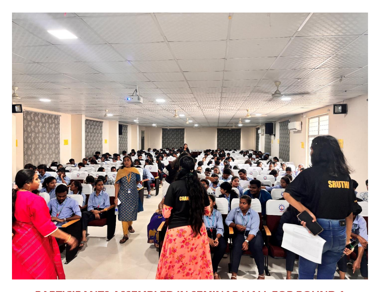
PARTICIPANTS ASSEMBLED IN SEMINAR HALL FOR ROUND 1 COORNIDATORS EXPLAINING ABOUT ROUNDS