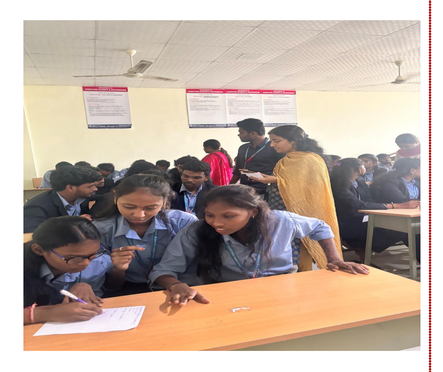
STUDENTS PARTICIPATING IN THE ROUND 2