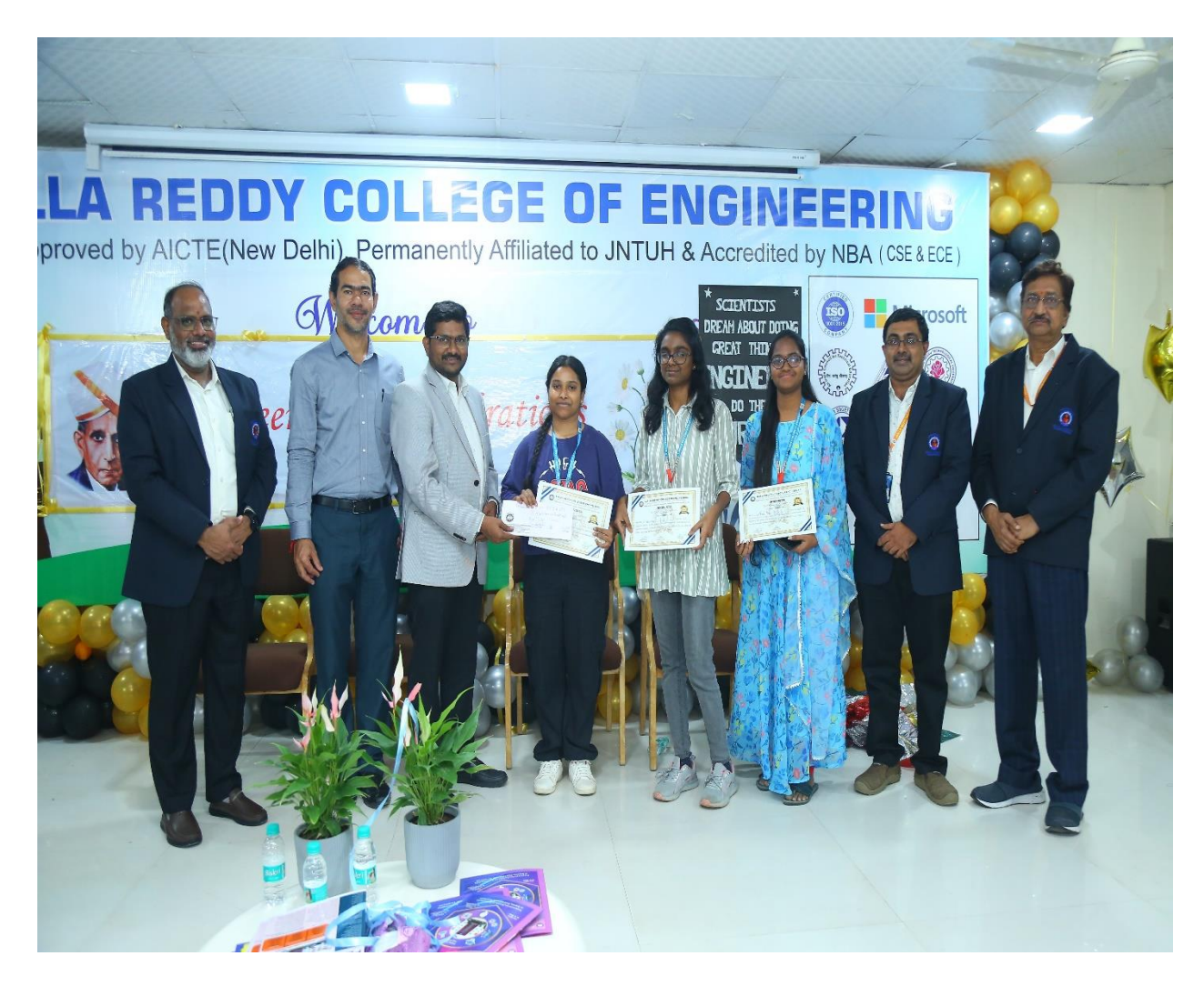
FIRST PRICE RECEIVING IN CELEBRATION OF ENGINEER'S DAY WITH CHIEF GUESTS AND PRINCIPAL SIR