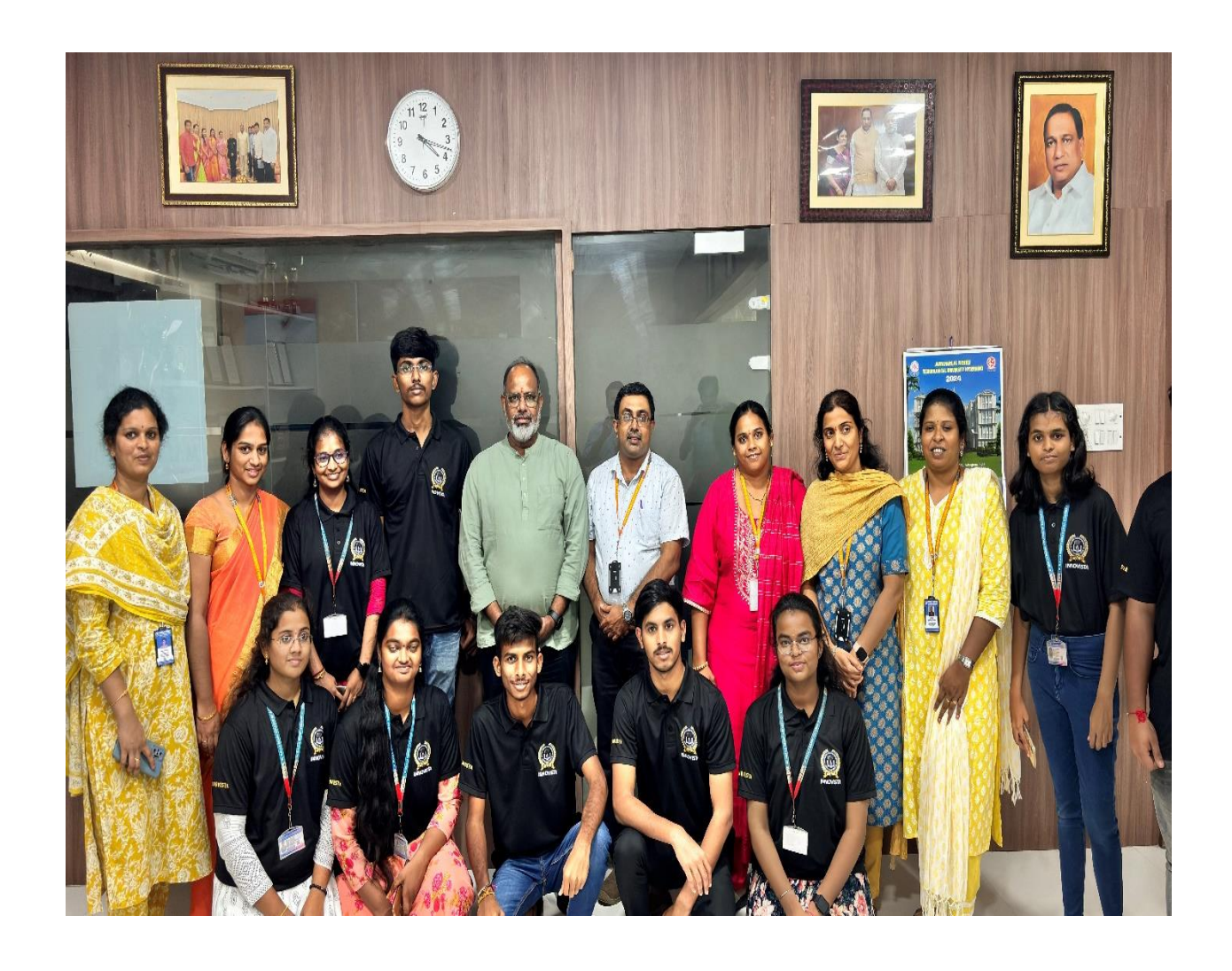
INNOVISTA TEAM AND INNOVISTA FACULTY COORDNATORS WITH PRINCIPAL SIR