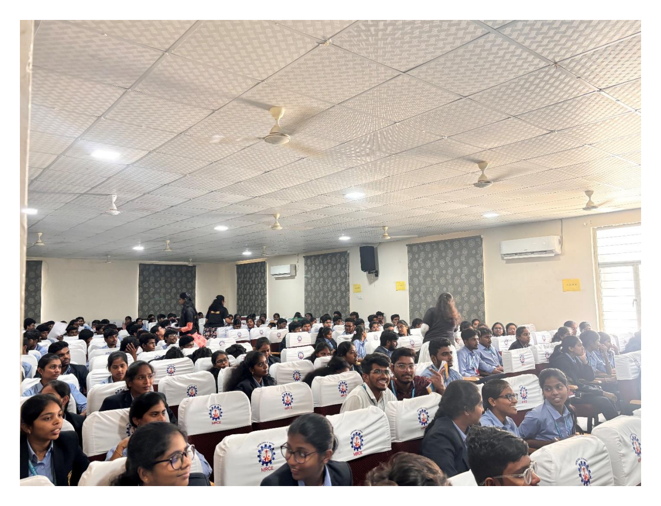
PARTICIPANTS ASSEMBLED IN SEMINAR HALL FOR ROUND 1