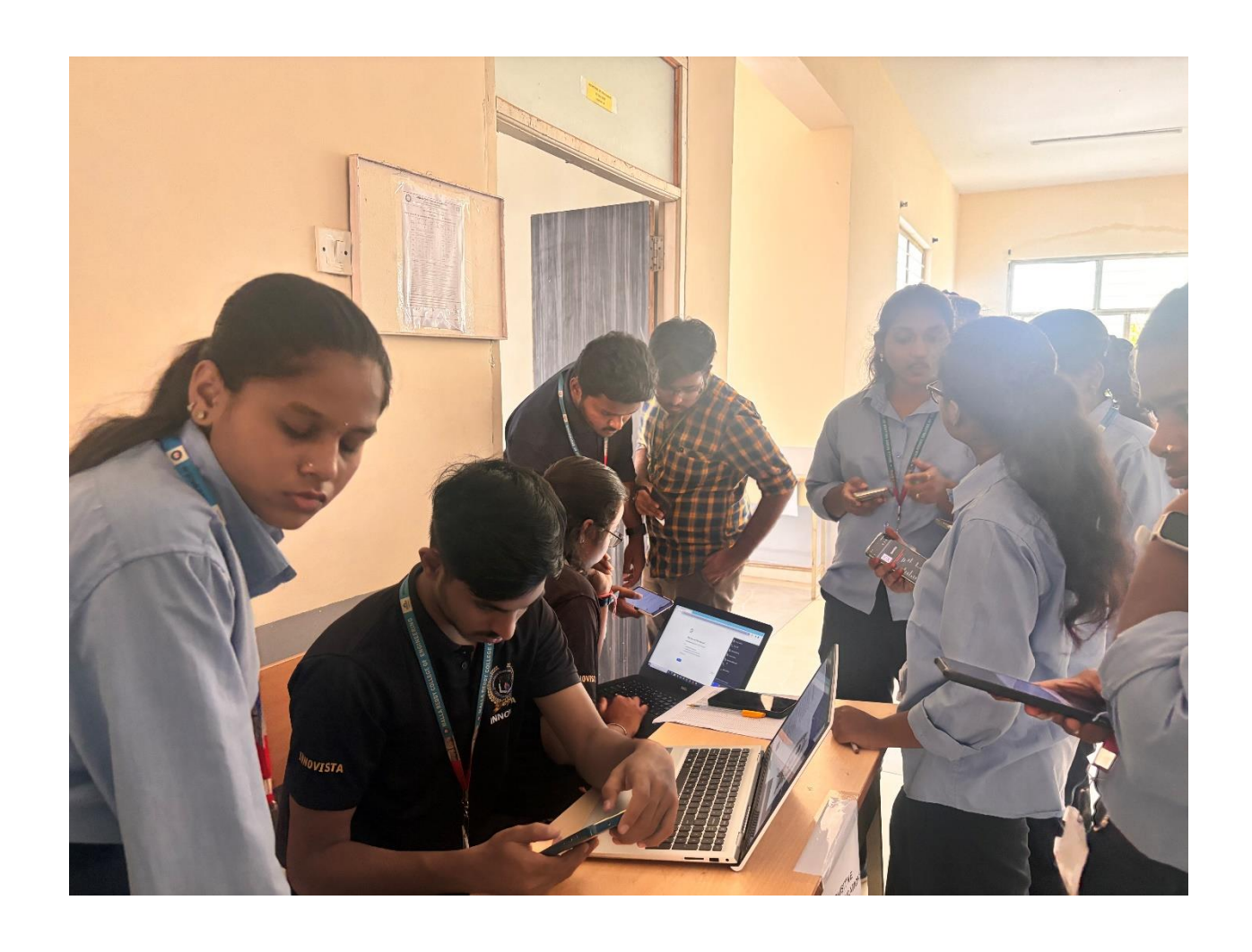
REGISTRATIONS TEAM IN THE INQUISITIVE-TECHNICAL QUIZ