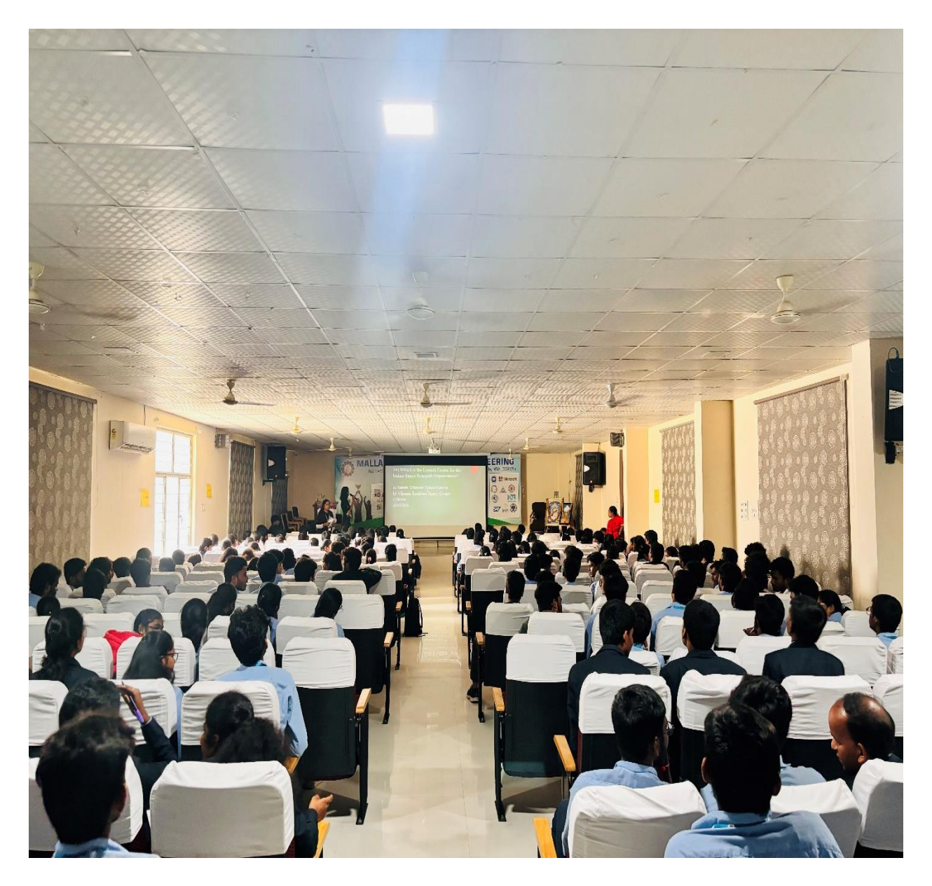
QUESTIONS ARE DISPLAYING FOR PARTICIPANTS IN THE ROUND 1