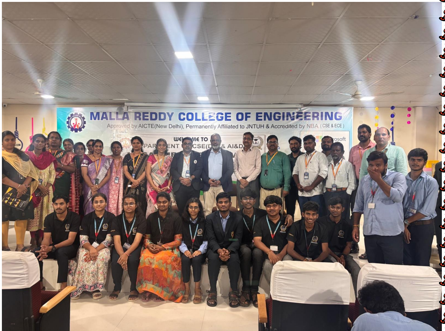
FINAL CLICK WITH PRINCIPAL, VICE PRINCIPAL, DEPARTMENT FACULTY MEMBERS AND STUDENTS COORDINATORS