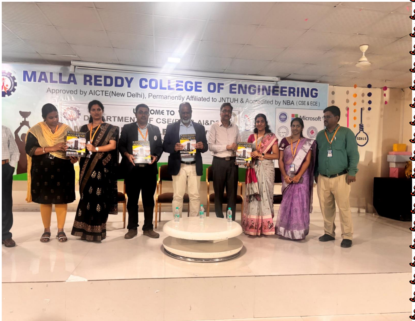
RELEASING MAGAZINE-IMMERSION VOL.2 BY THE HANDS OF PRINCIPAL AND VICE PRINCIPAL