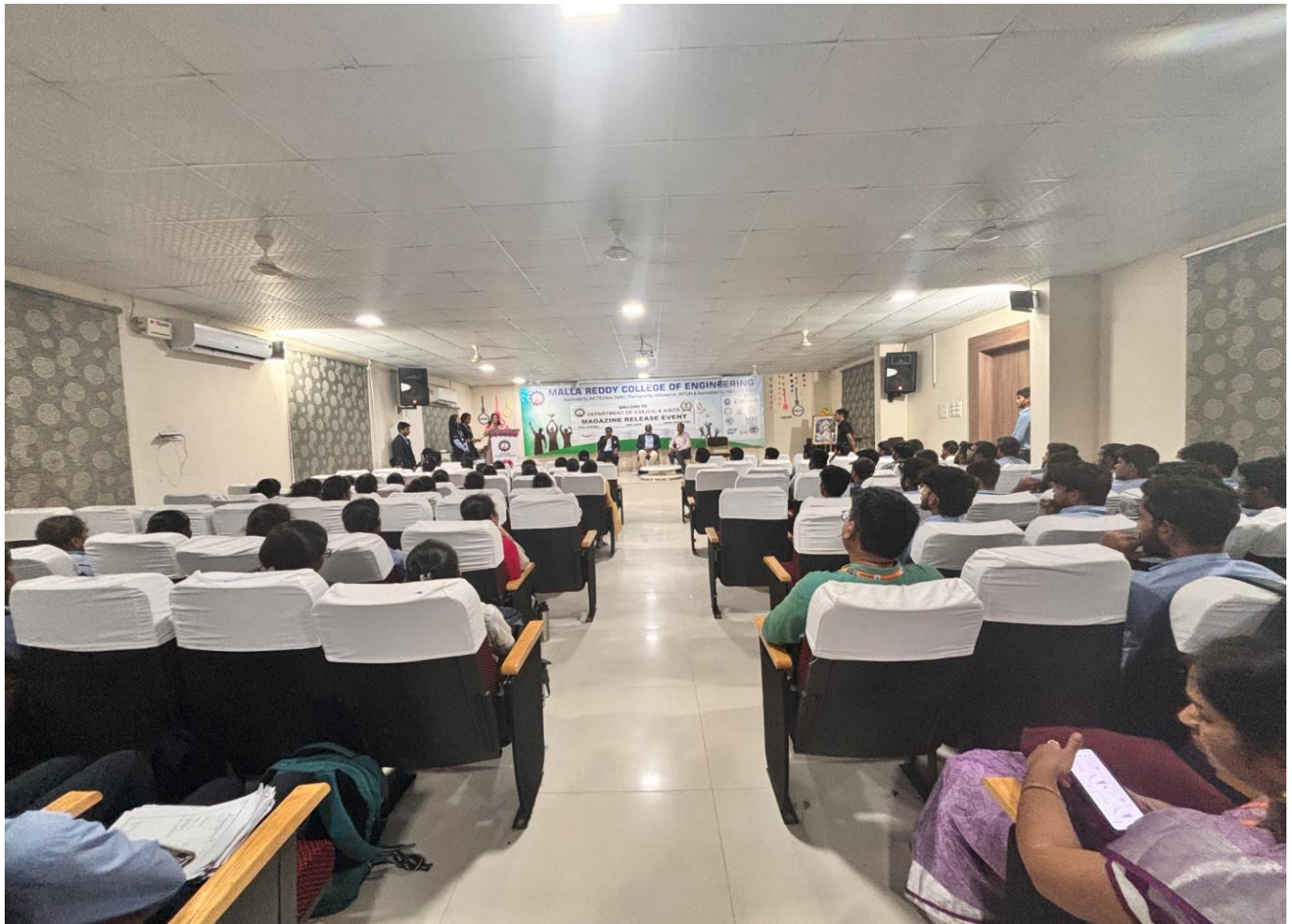
FACULTY AND STUDENTS IN SEMINAR HALL