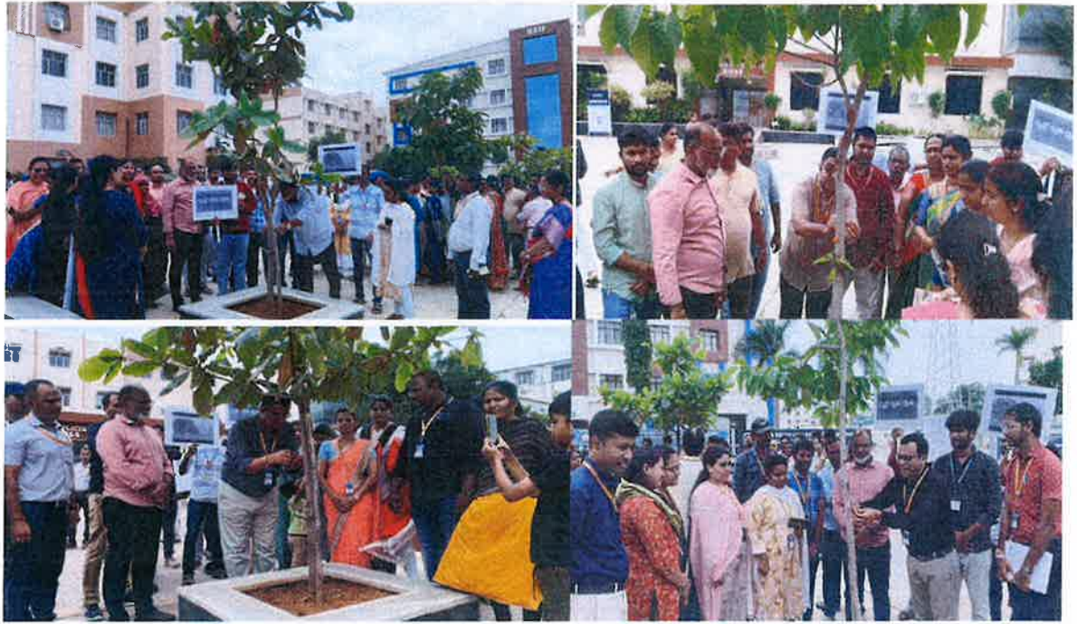
Day 4 (09-08-2025) Tying Rakhis to trees