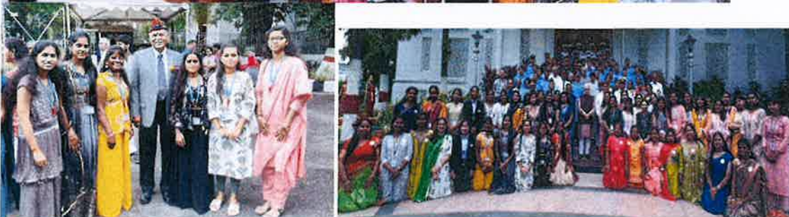
Day 3 (08-08-2025) Students tying rachis to Hon'ble Governor at Rajbhavan