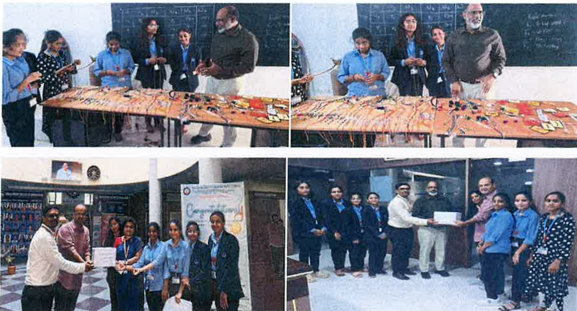
Day 1(26-07-2025): Making of Handmade rakhis by MRCE students for soliders at borders

The celebrations continued on 8th August 2025 with a visit to the Raj Bhavan, where representatives from MRCE tied rakhis to the Hon'ble Governor and security personnel, symbolising honour towards leadership and appreciation for those safeguarding important state institutions. The final day, 9th August 2025, was celebrated in the college with the theme Vruksha Raksha (protection of trees). The day began with tying rakhis to plants, promoting the message of environmental conservation. A formal programme followed in the seminar hall, including an audio-visual presentation on the significance of Raksha Bandhan, welcoming of dignitaries, a speech by the IKS Convener, and an inspiring address by the Principal emphasising unity, cultural values, and environmental stewardship. The event concluded with HODs, Deans, and faculty members tying rakhis to one another, sweet distribution, and a group photograph, marking the end of a meaningful celebration.