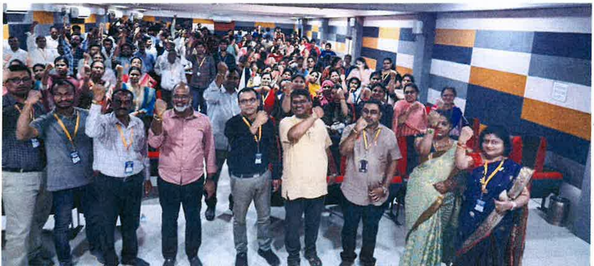
Day 4 (09-08-2025) Raksha Bhandhan Celebrations in MRCE