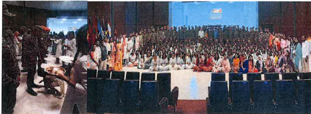
Day 2 (07-08-2025): Students tying rachis to soldiers at Army unit Bolaram.